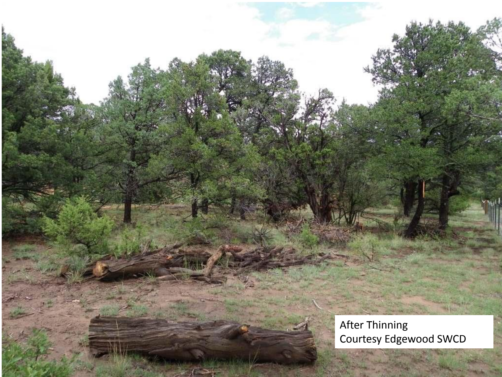
After Thinning