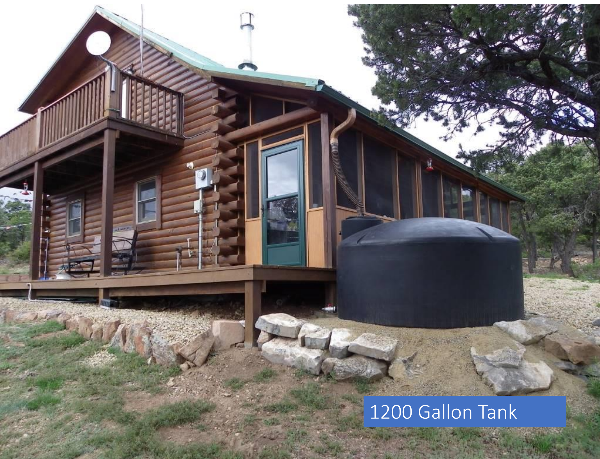
1200 Gallon Tank