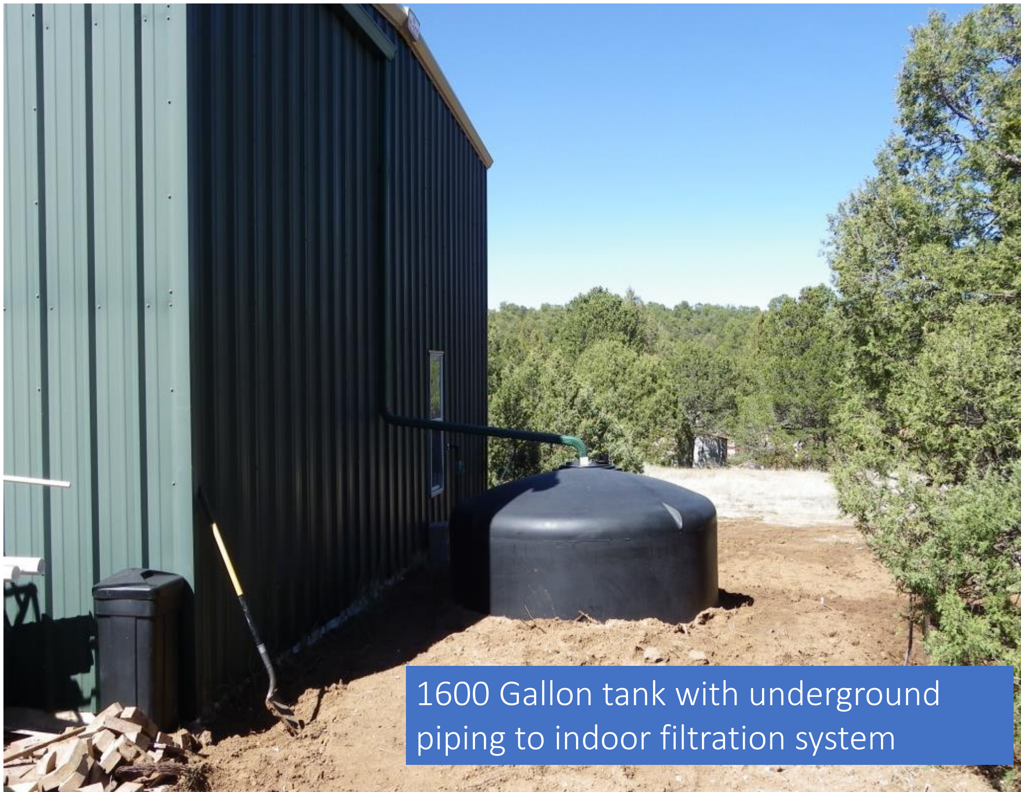
1600 Gallon tank with underground piping to indoor filtration system