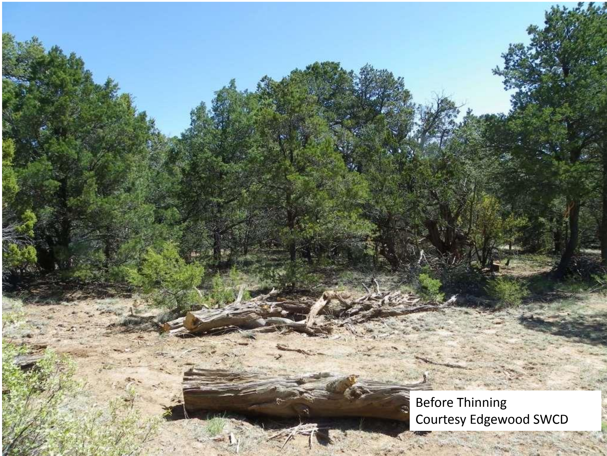
Before Thinning