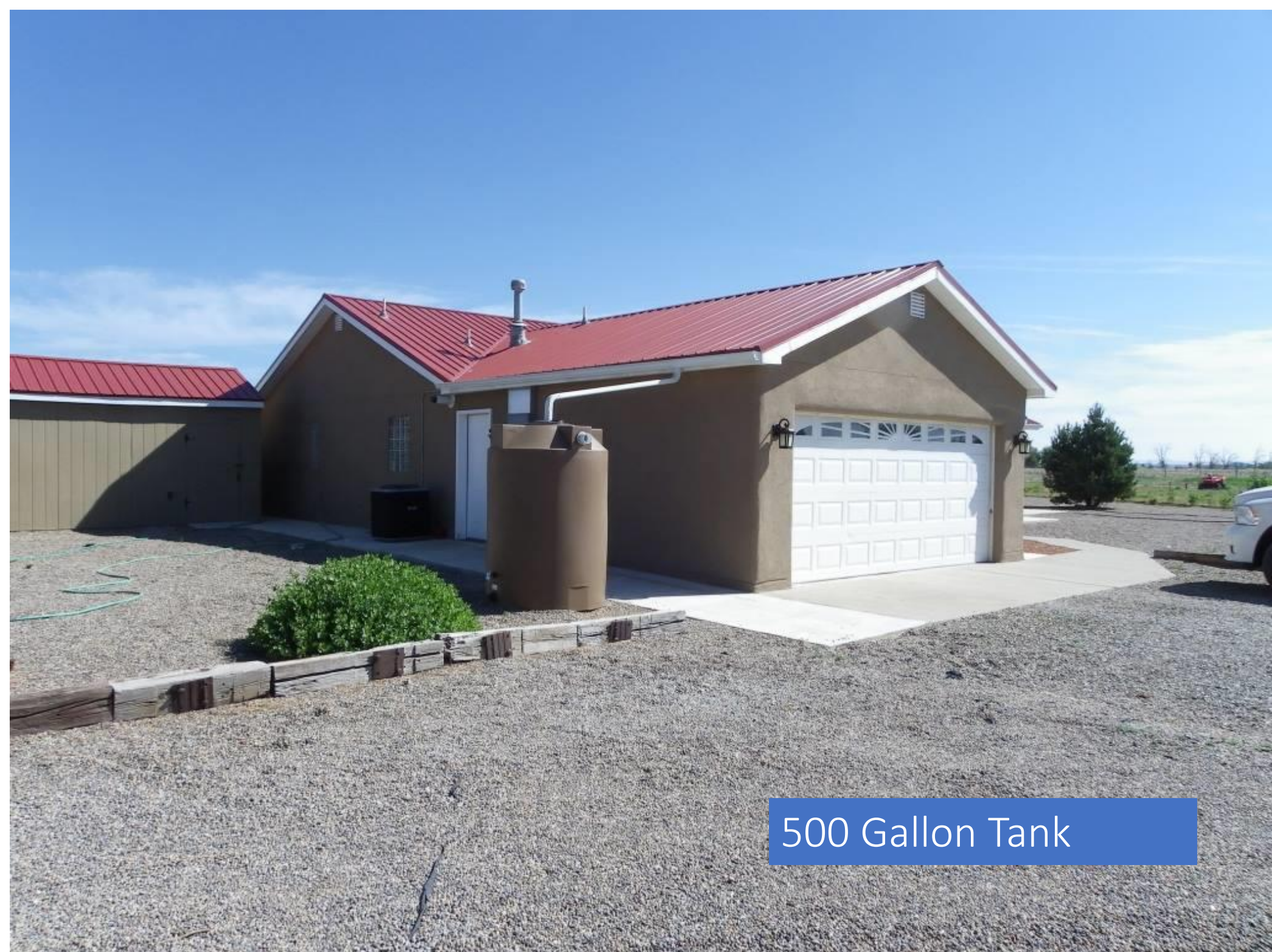
500 Gallon Tank