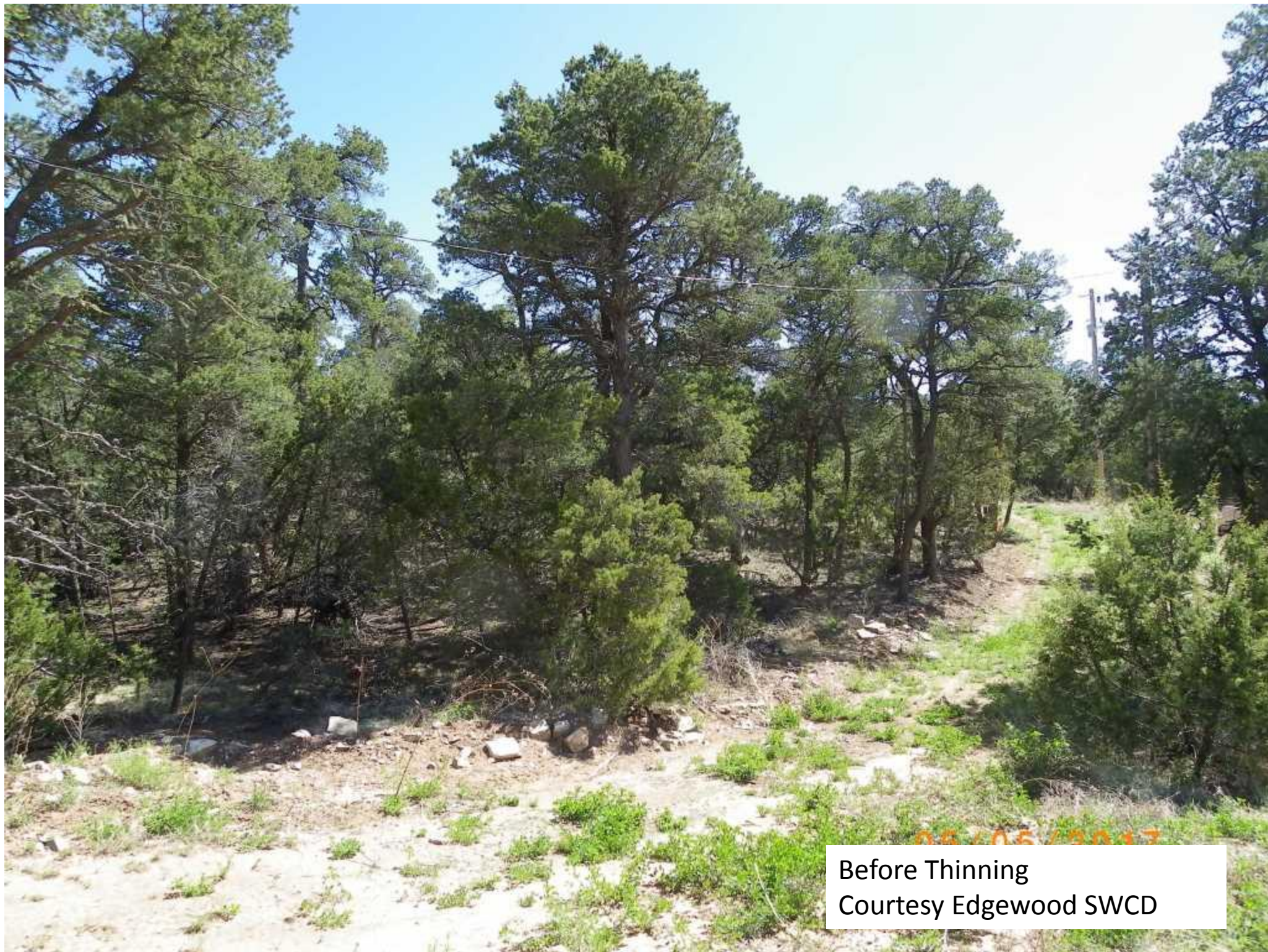
08/05/2017 Before Thinning