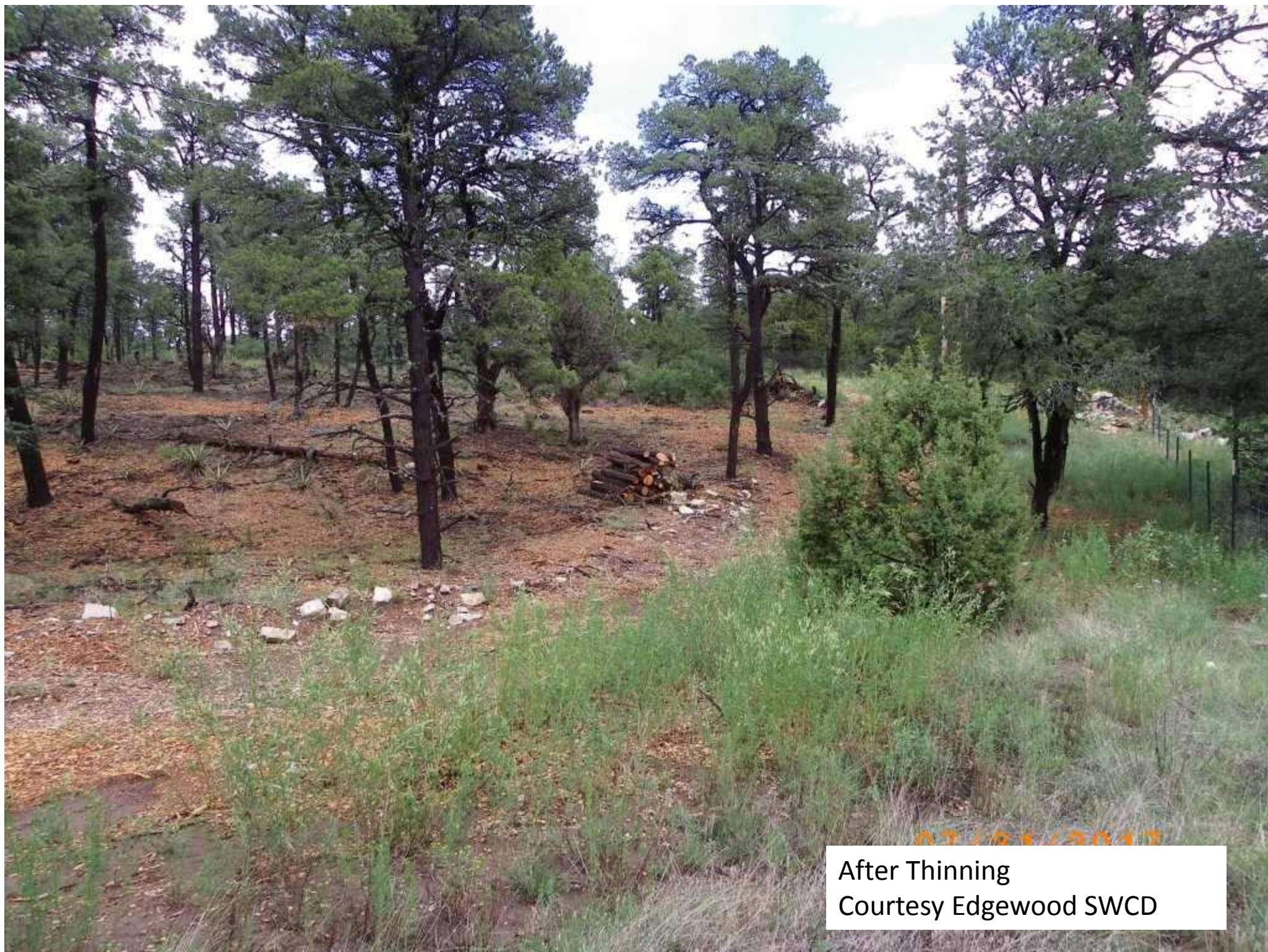
After Thinning