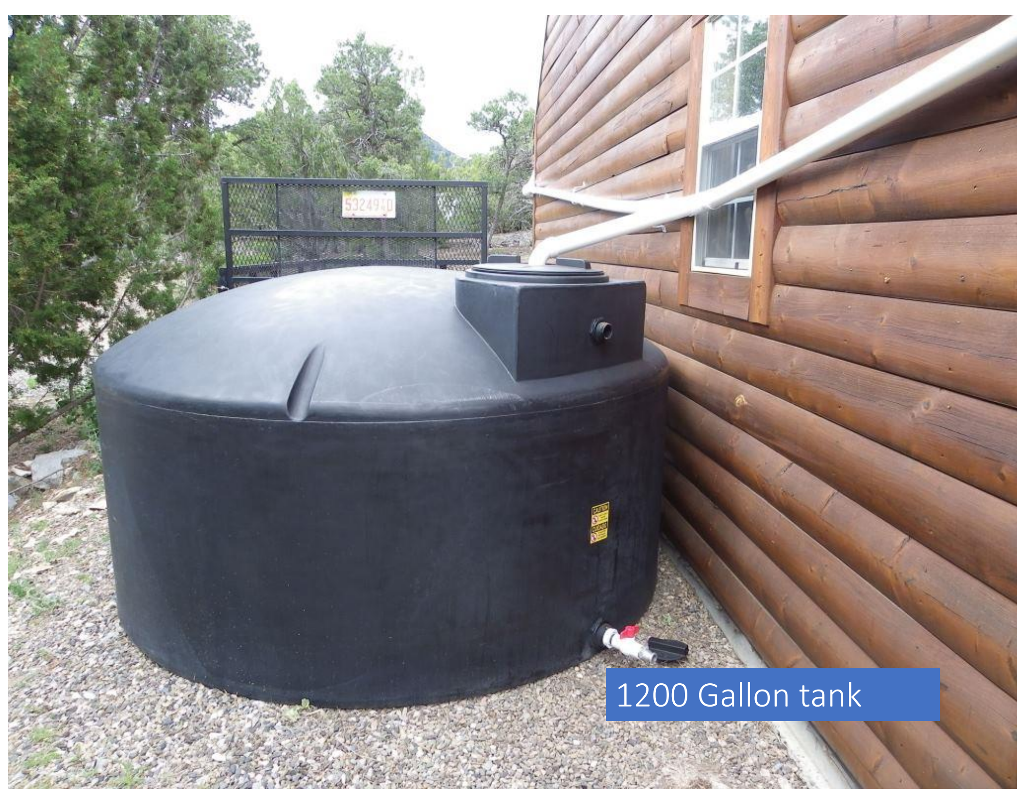
1200 Gallon tank