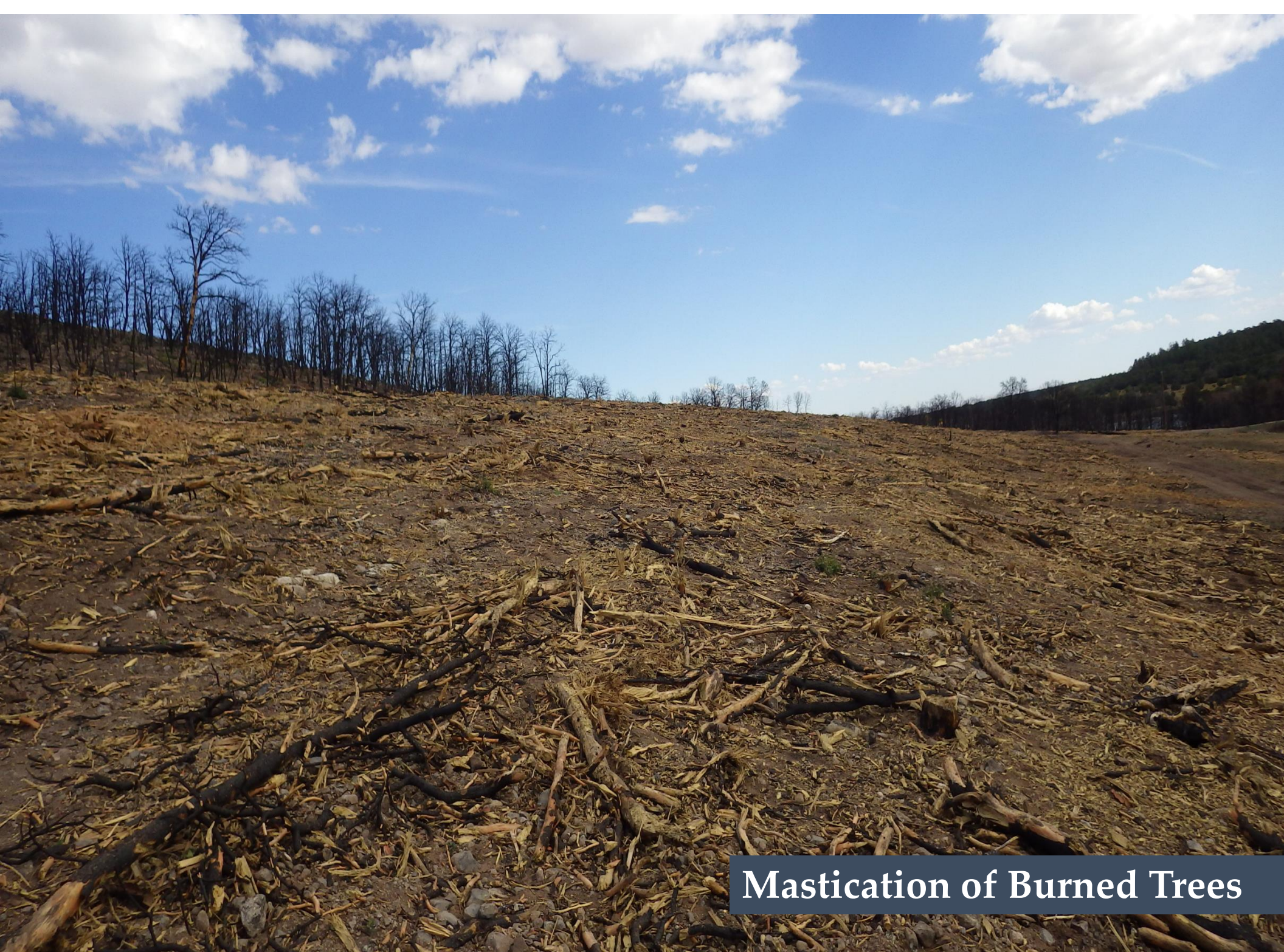
Mastication of Burned Trees