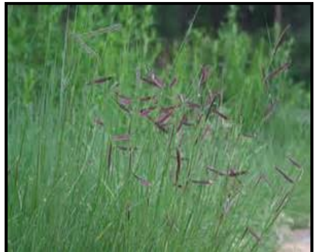
Blue Grama is a warm-season perennial grass.