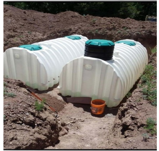
Underground Water Storage Tanks

The Function of a Conservation District is to take available technical, financial, and educational resources, whatever their source, and focus or coordinate them so they meet the needs of the local land user.