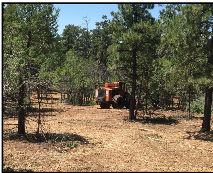
Pueblo of Isleta Fire Crew ~ 2015

In addition to the work funded through the Joint Chiefs Initiative, the Pueblo of Isleta has continued restoration on the south eastern corner of their land, while Chilili Land Grant has continued to thin and remove material from 290 acres of their adjacent to the Cibola. The Pueblo and Chilili have executed their work by developing and training local thinning crews comprised of a diverse mix of ethnic backgrounds including Native Americans and Hispanic community members.