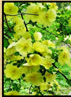
Manchu Rose (Rosa Xanthina)

2ft. bundle of 10 for $22.00 Or $3.00 Each