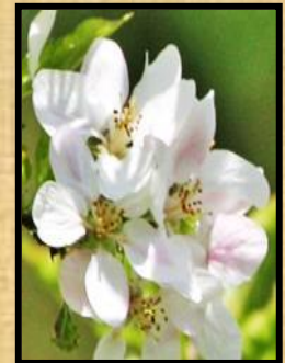
Native American Plum (Prunus Americana)

3ft. bundle of 10 for $22.00 Or $3.00 Each