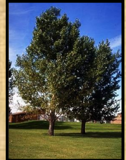
Imperial Poplar (Populus x Canadensis)

4ft. bundle of 10 for $22.00 Or $3.00 Each