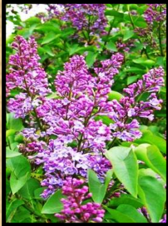
Common Purple Lilac (Syringa Vulgaris)

3ft. bundle of 10 for $22.00 Or $3.00 Each