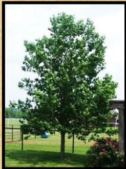
Cottonless Cottonwood (Populus x Canadensis)

4ft. bundle of 10 for $22.00 Or $3.00 Each