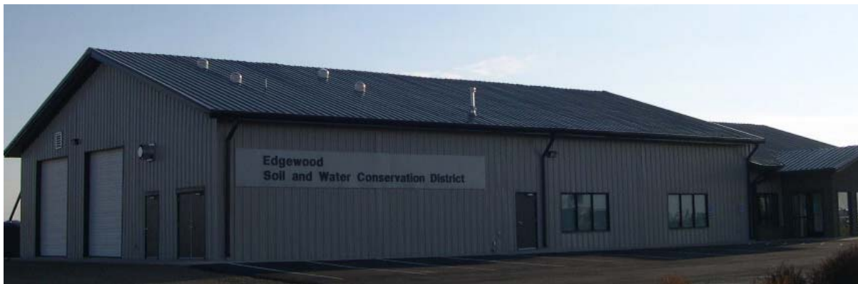
Edgewood SWCD on Route 66, one mile west of Moriarty

The Edgewood SWCD Board of Supervisors and staff encourage all landowners to visit the new building, Monday – Friday, 8:00 AM – 4:30 PM. This facility was built by Shiver Construction.